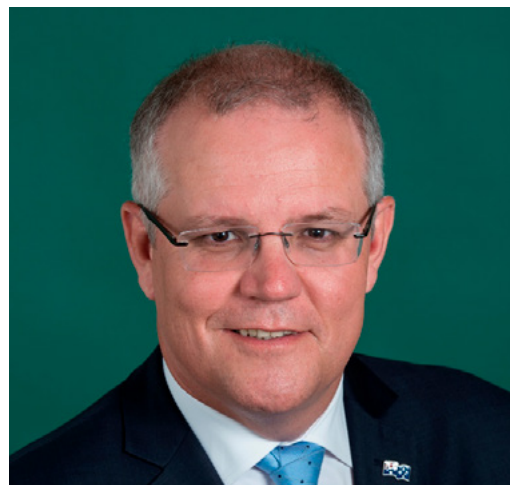
The Prime Minister, the Hon Scott Morrison MP