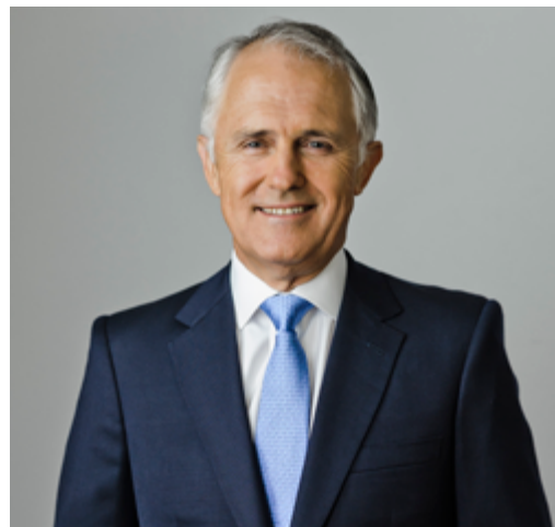
The Prime Minister, the Hon Malcolm Turnbull MP